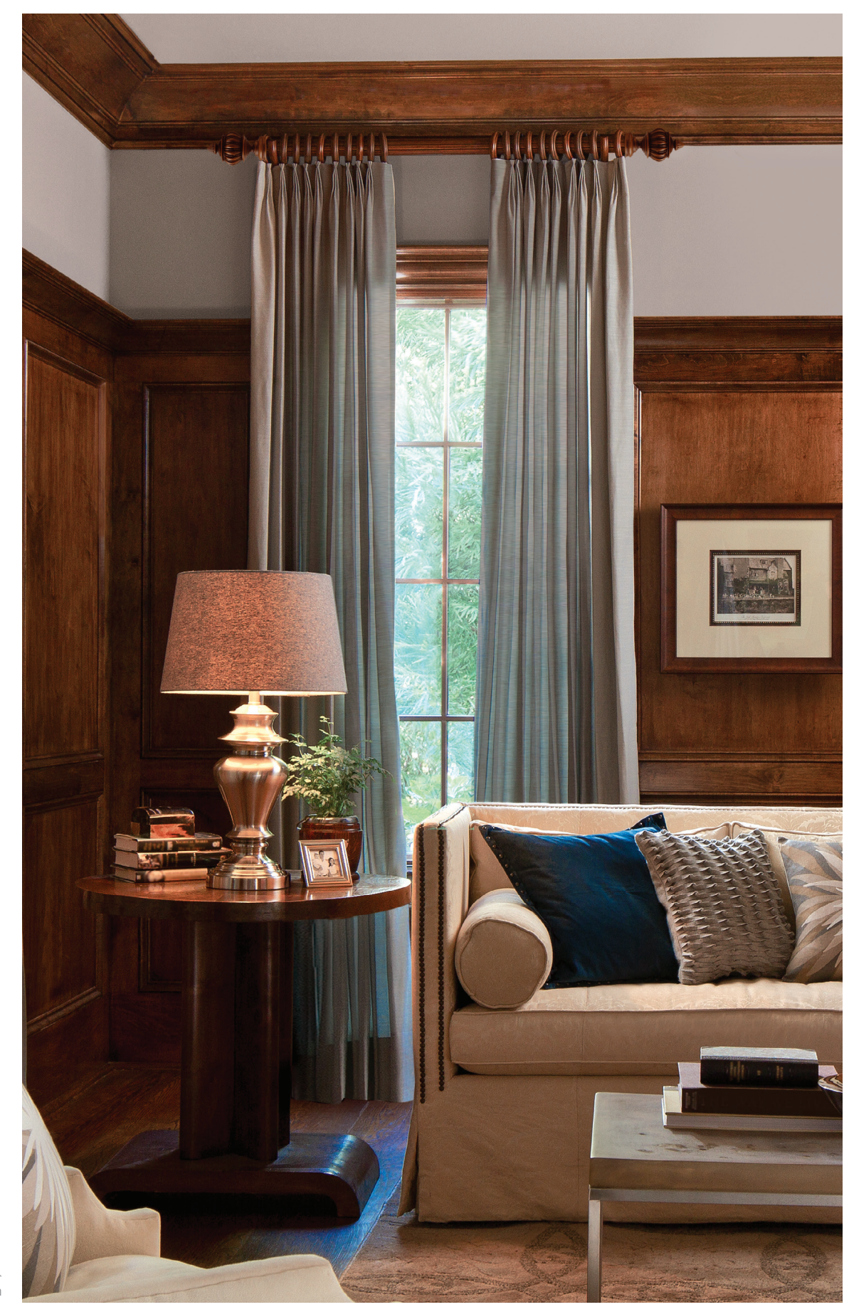
ARMADA Tortoise Shown