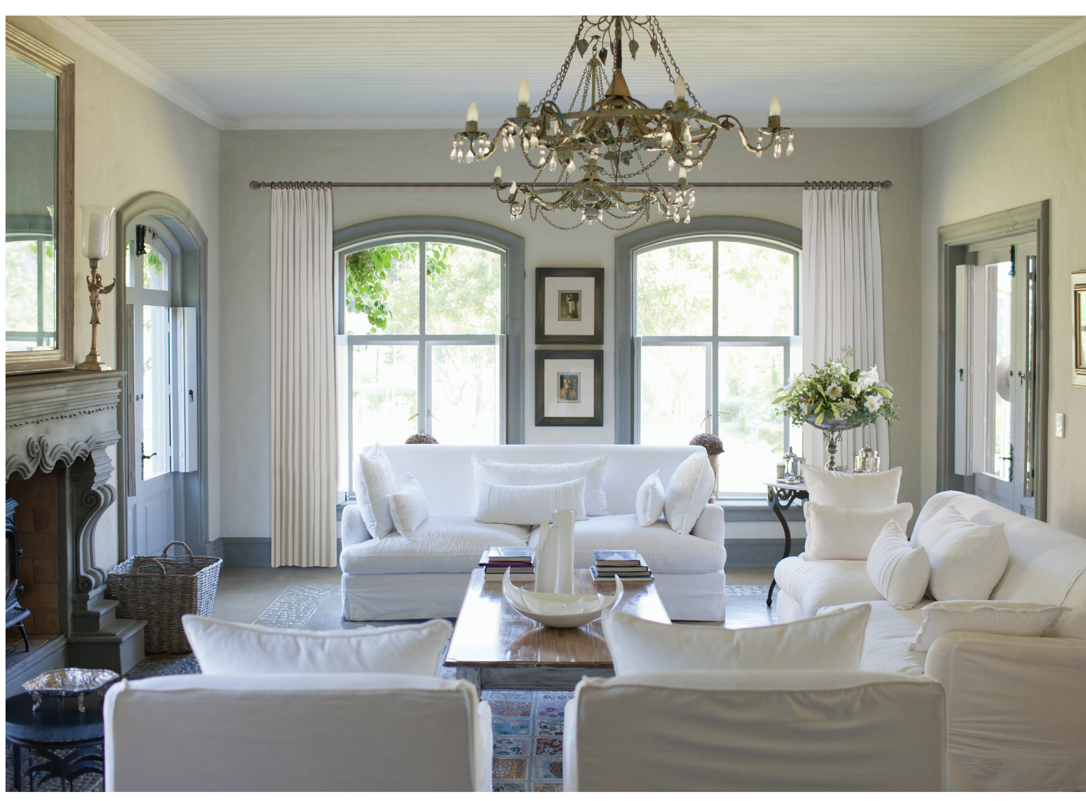
VICTORIAN Golden Heirloom Shown

DECORATIVE RING Tortoise Shown. Size 2".