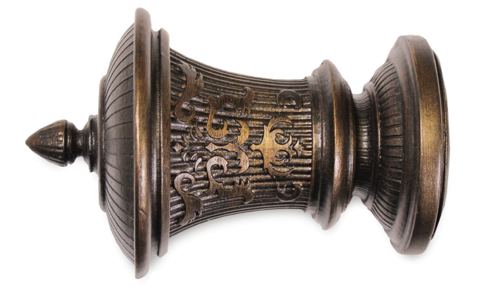
RENAISSANCE Bronze Shown. Size 2".